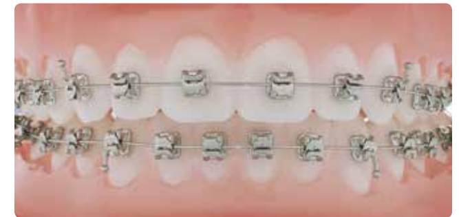
Rh EXPERIENCE mini metal Rhodium