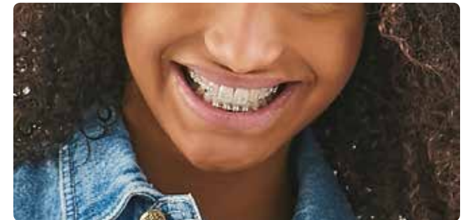
Rh LEGEND mini Rhodium

Depending on the treatment offered, you can choose between a traditional metal bracket, or a more discreet Rhodium metal bracket. Rhodium brackets are highly aesthetic due to their low reflective matte finish. Your Orthodontist will advise you according to your defined treatment plan.